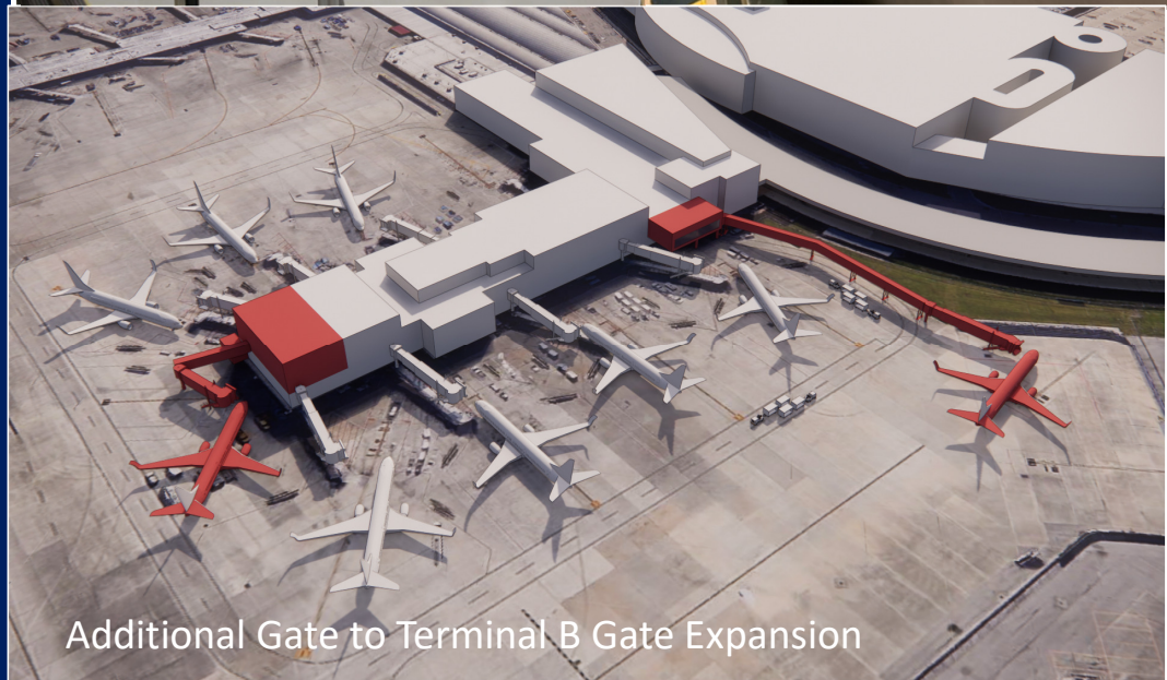
Additional Gate to Terminal B Gate Expansion