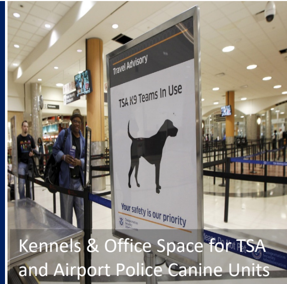
Kennels & Office Space for TSA and Airport Police Canine Units

$10M Projected Task Orders for FY22 Budget